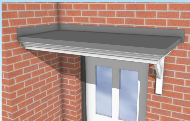
Left-hand Corner-fit with Corner Roof upstand