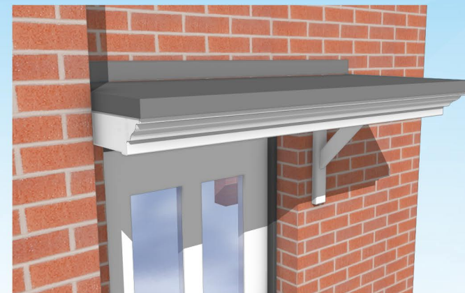
Left-hand Corner-fit with Standard Abutment detail (also available as Right-hand)