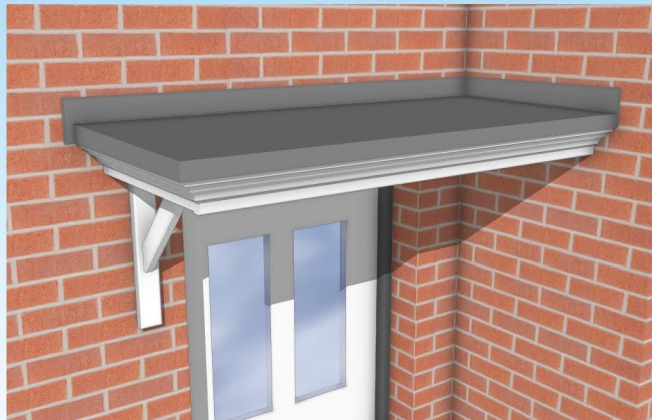
Right-hand Corner-fit with Corner Roof upstand