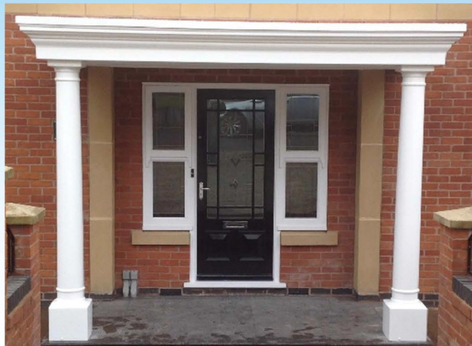
Standard Smooth Columns