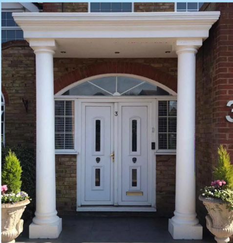
Extra Tall Smooth Columns