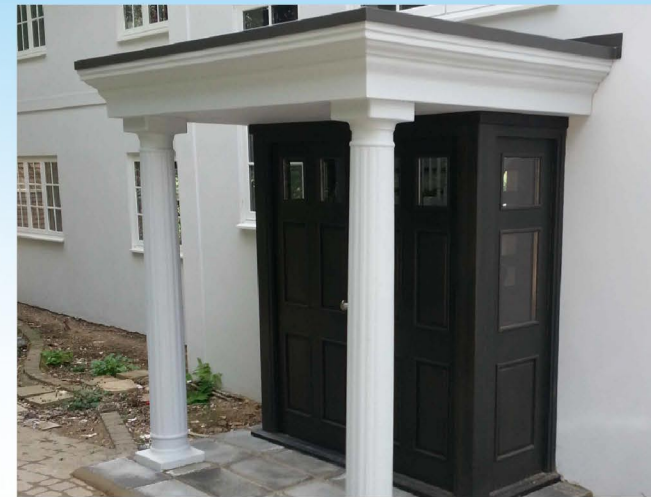
Standard Fluted Columns